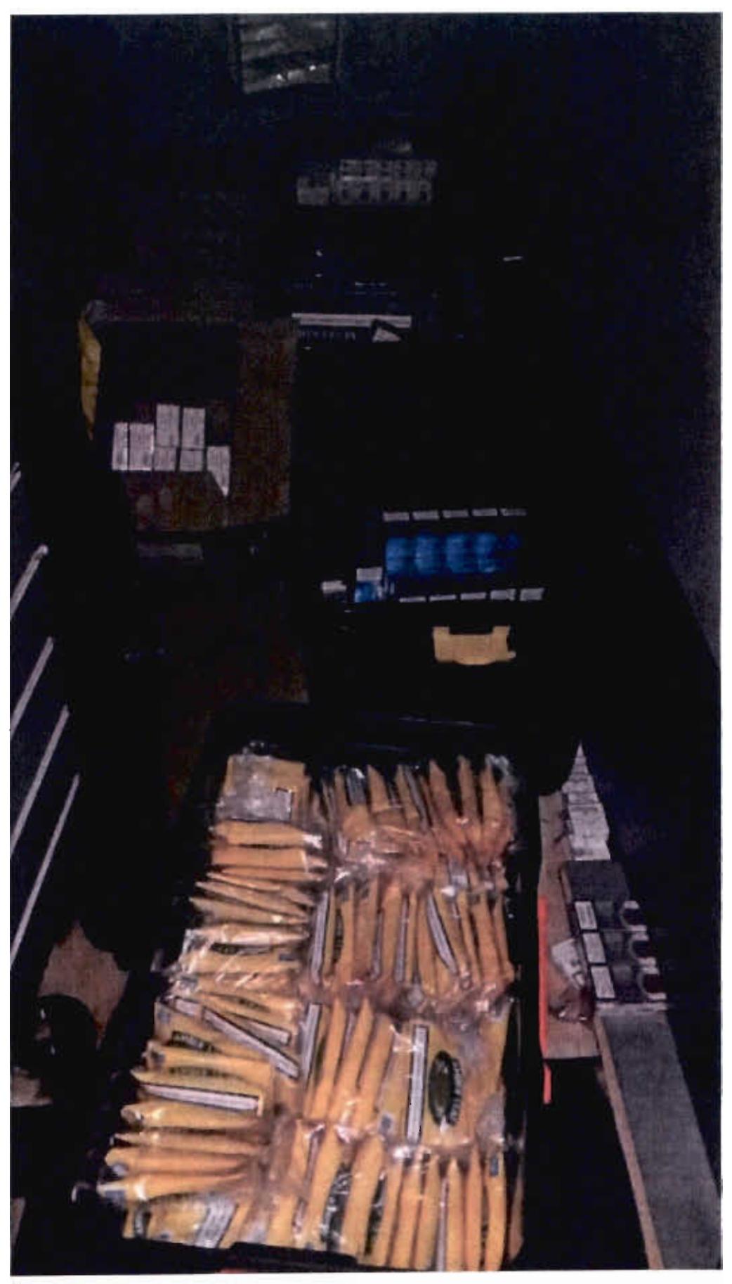
Kings gate news